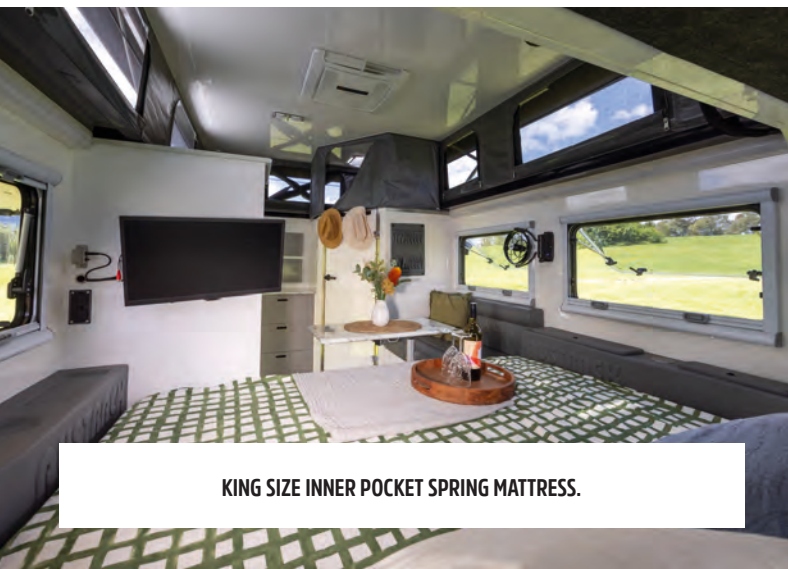
KING SIZE INNER POCKET SPRING MATTRESS.