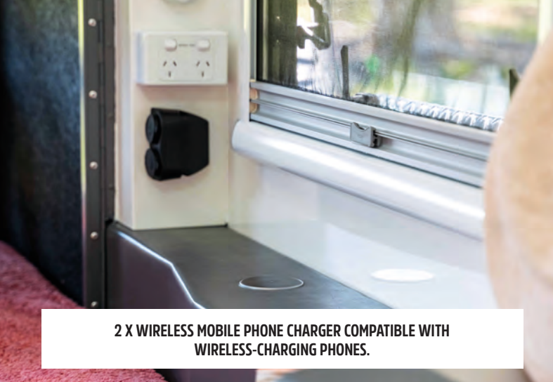
2 X WIRELESS MOBILE PHONE CHARGER COMPATIBLE WITH WIRELESS-CHARGING PHONES.