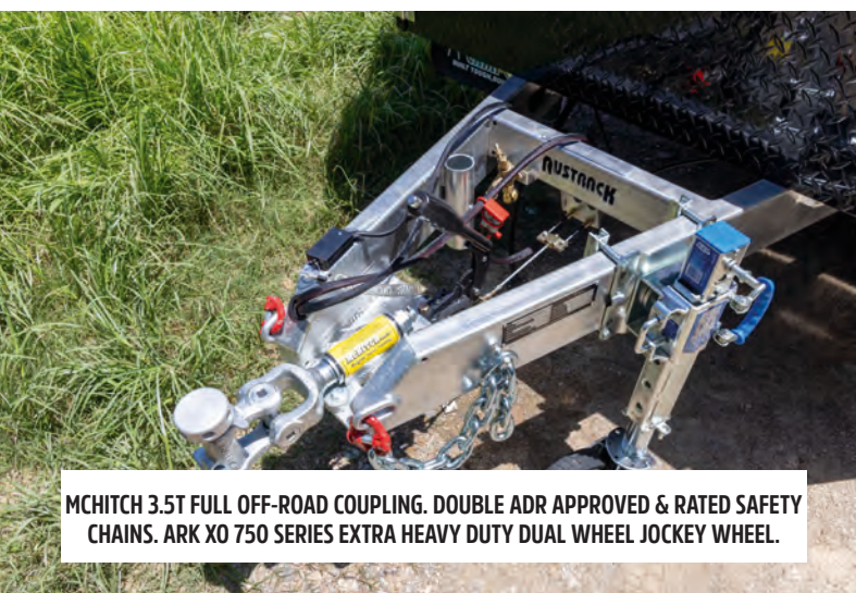
MCHITCH 3.5T FULL OFF-ROAD COUPLING. DOUBLE ADR APPROVED & RATED SAFETY CHAINS. ARK XO 750 SERIES EXTRA HEAVY DUTY DUAL WHEEL JOCKEY WHEEL.