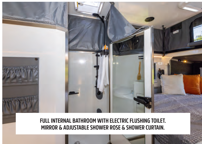
FULL INTERNAL BATHROOM WITH ELECTRIC FLUSHING TOILET. MIRROR & ADJUSTABLE SHOWER ROSE & SHOWER CURTAIN.