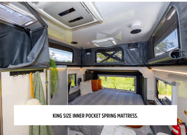
KING SIZE INNER POCKET SPRING MATTRESS.