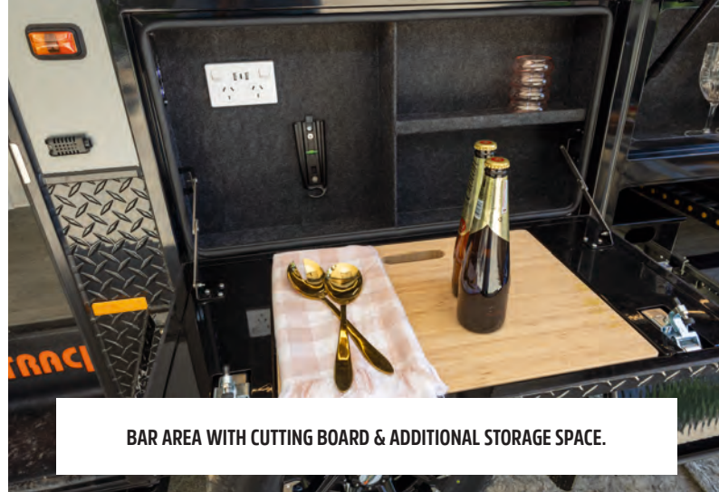
BAR AREA WITH CUTTING BOARD & ADDITIONAL STORAGE SPACE.