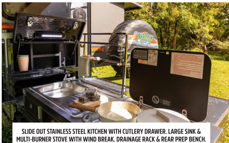
SLIDE OUT STAINLESS STEEL KITCHEN WITH CUTLERY DRAWER. LARGE SINK & MULTI-BURNER STOVE WITH WIND BREAK. DRAINAGE RACK & REAR PREP BENCH.