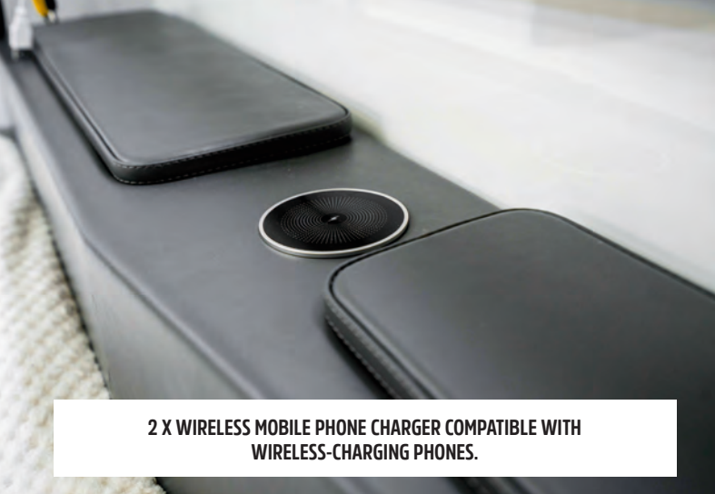
2 X WIRELESS MOBILE PHONE CHARGER COMPATIBLE WITH WIRELESS-CHARGING PHONES.