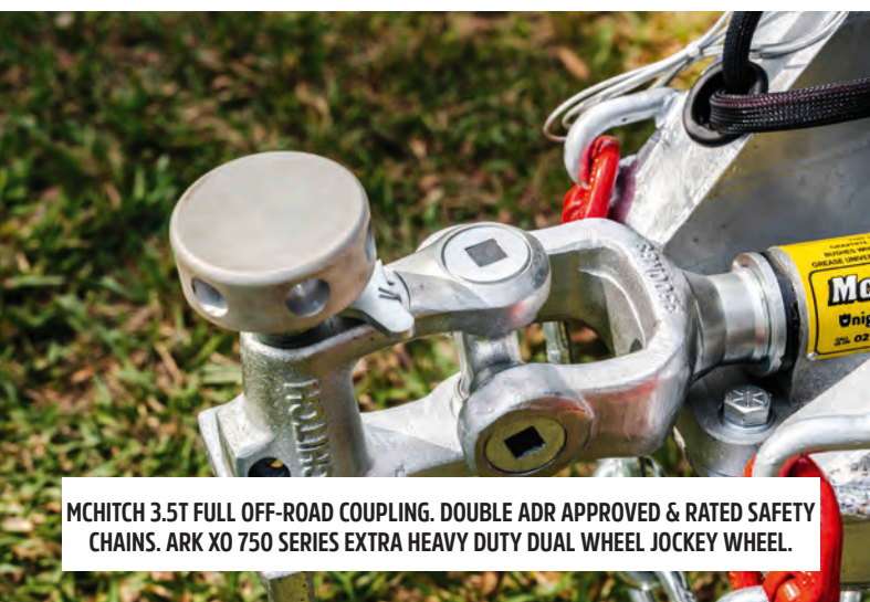
MCHITCH 3.5T FULL OFF-ROAD COUPLING. DOUBLE ADR APPROVED & RATED SAFETY CHAINS. ARK XO 750 SERIES EXTRA HEAVY DUTY DUAL WHEEL JOCKEY WHEEL.