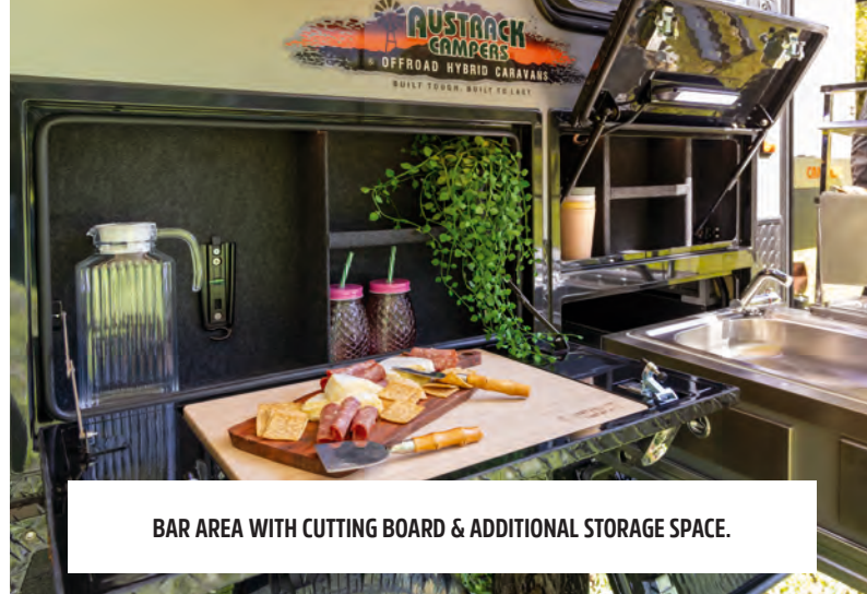
BAR AREA WITH CUTTING BOARD & ADDITIONAL STORAGE SPACE.