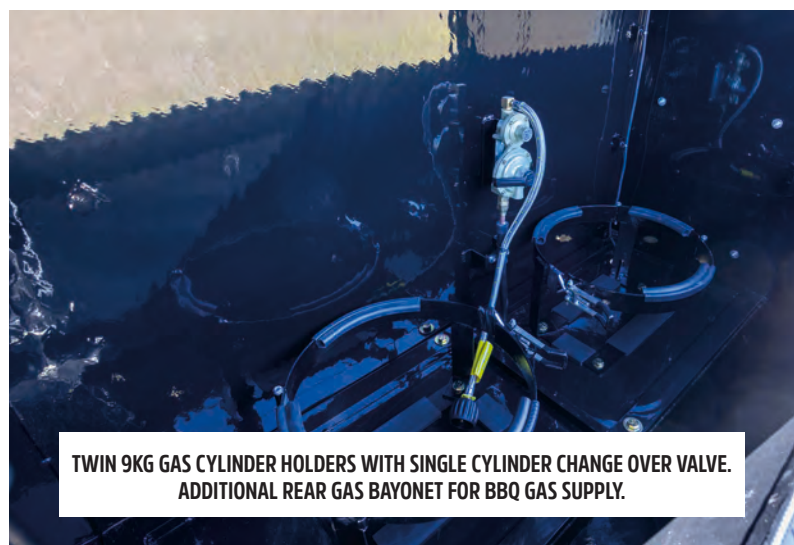
TWIN 9KG GAS CYLINDER HOLDERS WITH SINGLE CYLINDER CHANGE OVER VALVE. ADDITIONAL REAR GAS BAYONET FOR BBQ GAS SUPPLY.