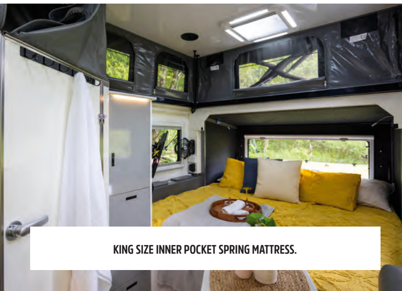
KING SIZE INNER POCKET SPRING MATTRESS.