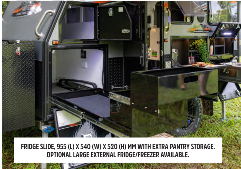
FRIDGE SLIDE, 955 (L) X 540 (W) X 520 (H) MM WITH EXTRA PANTRY STORAGE. OPTIONAL LARGE EXTERNAL FRIDGE/FREEZER AVAILABLE.