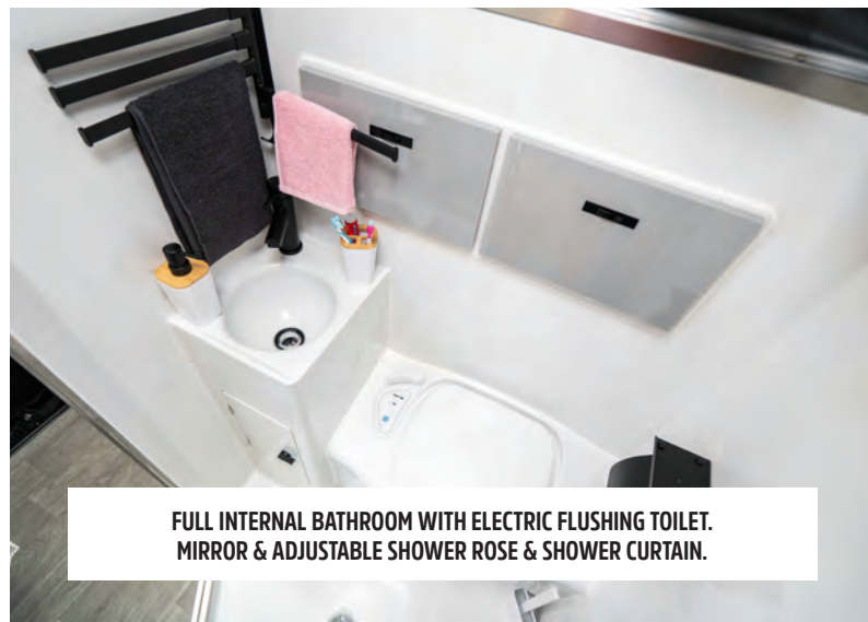
FULL INTERNAL BATHROOM WITH ELECTRIC FLUSHING TOILET. MIRROR & ADJUSTABLE SHOWER ROSE & SHOWER CURTAIN.