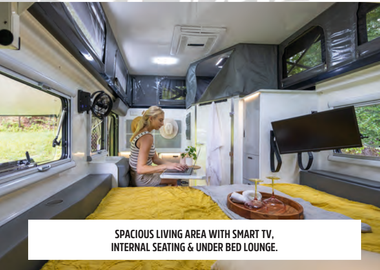
SPACIOUS LIVING AREA WITH SMART TV, INTERNAL SEATING & UNDER BED LOUNGE.