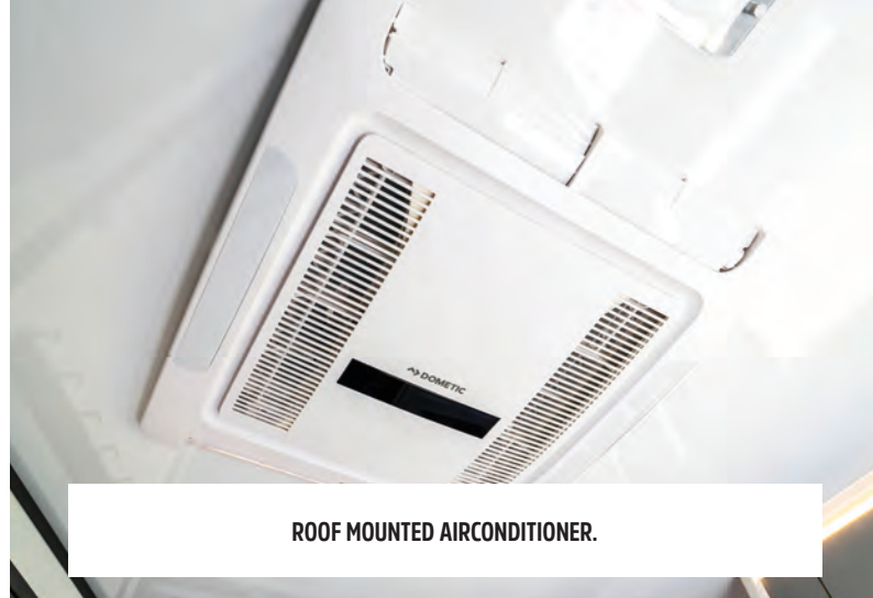
ROOF MOUNTED AIRCONDITIONER.