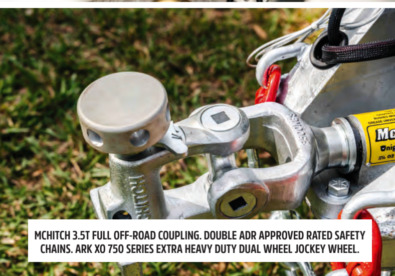
MCHITCH 3.5T FULL OFF-ROAD COUPLING. DOUBLE ADR APPROVED RATED SAFETY CHAINS. ARK XO 750 SERIES EXTRA HEAVY DUTY DUAL WHEEL JOCKEY WHEEL.