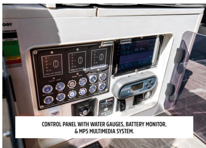
CONTROL PANEL WITH WATER GAUGES, BATTERY MONITOR, & MP5 MULTIMEDIA SYSTEM.