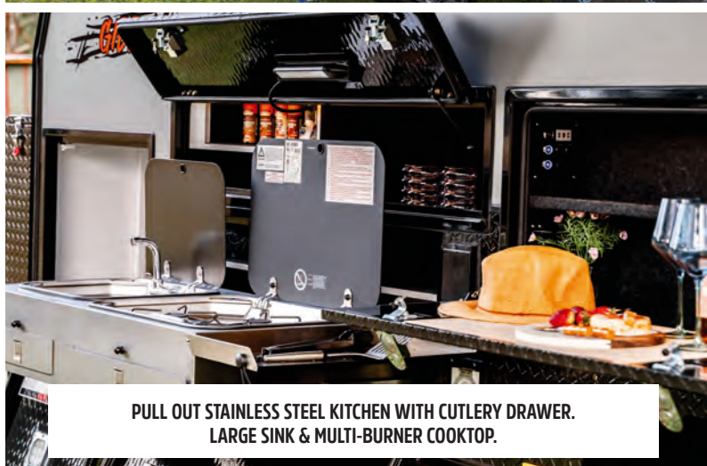
PULL OUT STAINLESS STEEL KITCHEN WITH CUTLERY DRAWER. LARGE SINK & MULTI-BURNER COOKTOP.