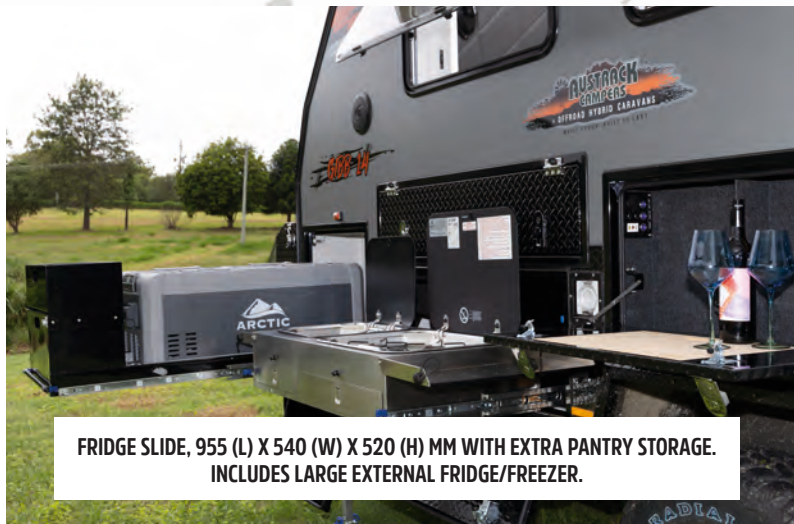
FRIDGE SLIDE, 955 (L) X 540 (W) X 520 (H) MM WITH EXTRA PANTRY STORAGE. INCLUDES LARGE EXTERNAL FRIDGE/FREEZER.