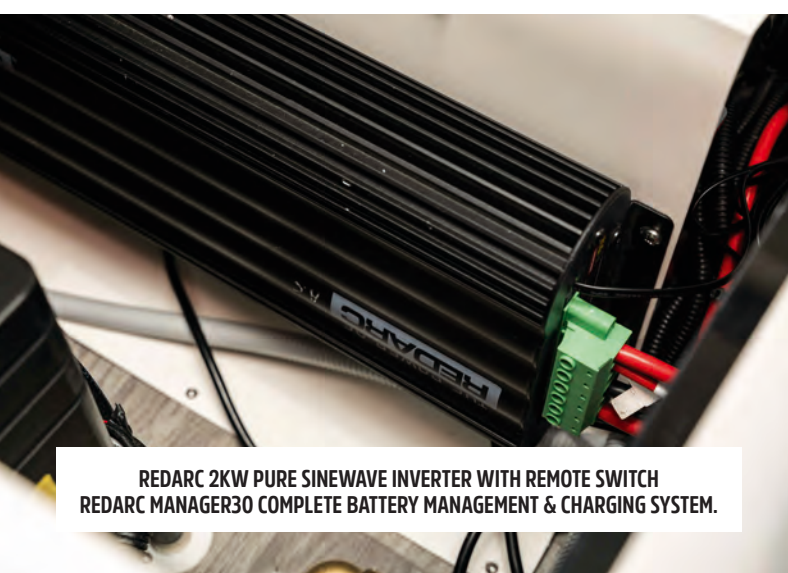
REDARC 2KW PURE SINEWAVE INVERTER WITH REMOTE SWITCH REDARC MANAGER30 COMPLETE BATTERY MANAGEMENT & CHARGING SYSTEM.