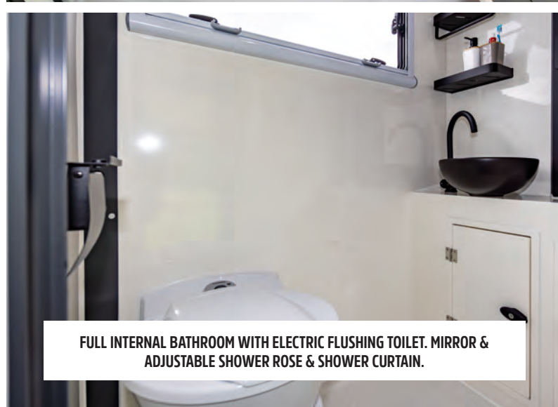
FULL INTERNAL BATHROOM WITH ELECTRIC FLUSHING TOILET. MIRROR & ADJUSTABLE SHOWER ROSE & SHOWER CURTAIN.