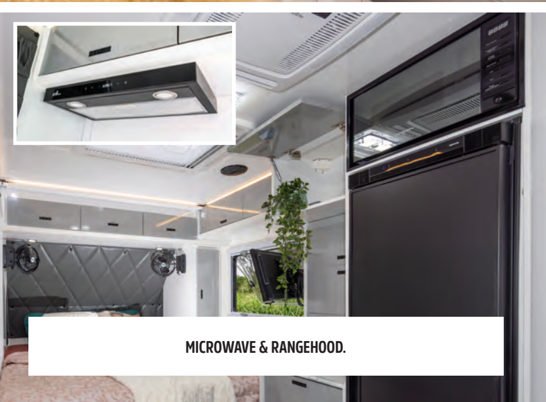
MICROWAVE & RANGEHOOD.