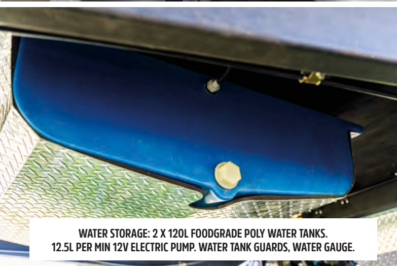
WATER STORAGE: 2 X 120L FOODGRADE POLY WATER TANKS. 12.5L PER MIN 12V ELECTRIC PUMP. WATER TANK GUARDS, WATER GAUGE.