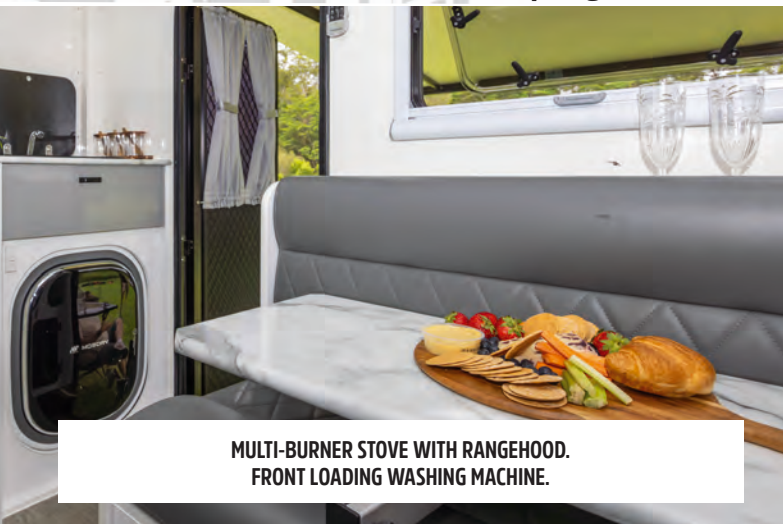
MULTI-BURNER STOVE WITH RANGEHOOD. FRONT LOADING WASHING MACHINE.