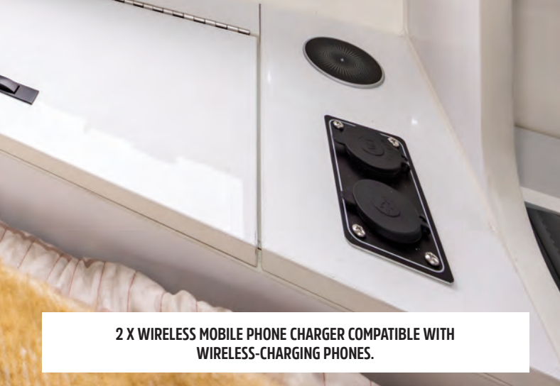
2 X WIRELESS MOBILE PHONE CHARGER COMPATIBLE WITH WIRELESS-CHARGING PHONES.