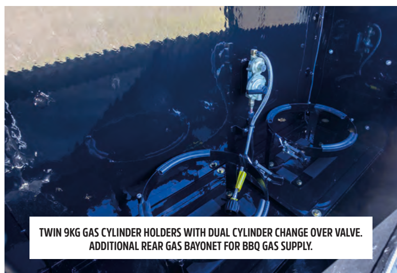
TWIN 9KG GAS CYLINDER HOLDERS WITH DUAL CYLINDER CHANGE OVER VALVE. ADDITIONAL REAR GAS BAYONET FOR BBQ GAS SUPPLY.