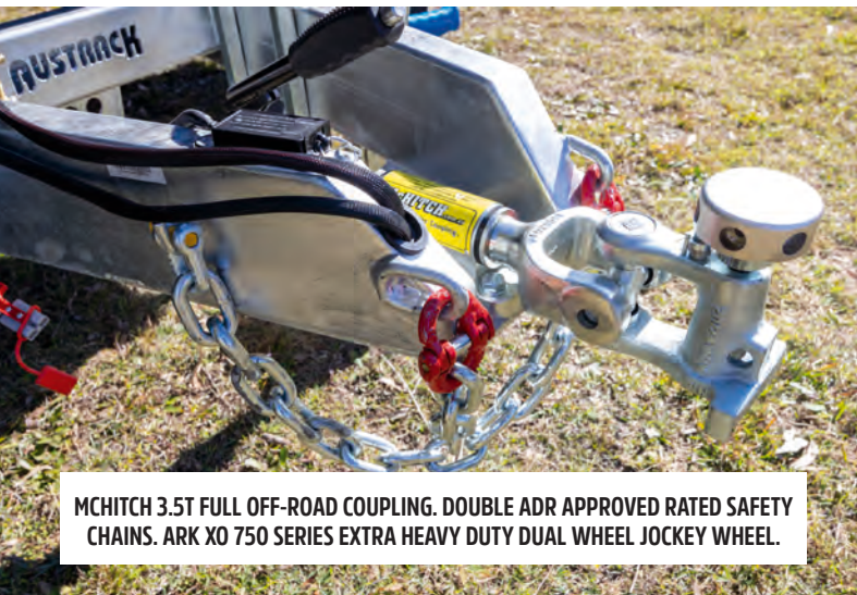
MCHITCH 3.5T FULL OFF-ROAD COUPLING. DOUBLE ADR APPROVED RATED SAFETY CHAINS. ARK XO 750 SERIES EXTRA HEAVY DUTY DUAL WHEEL JOCKEY WHEEL.