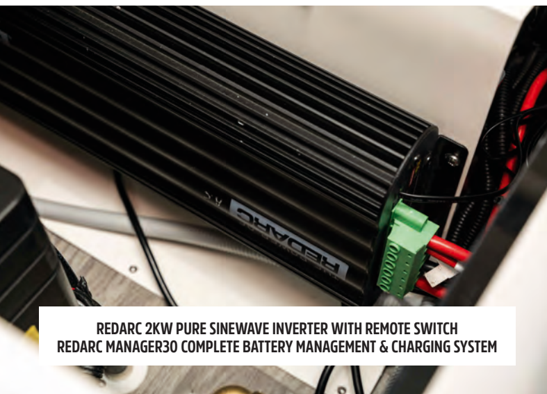
REDARC 2KW PURE SINEWAVE INVERTER WITH REMOTE SWITCH REDARC MANAGER30 COMPLETE BATTERY MANAGEMENT & CHARGING SYSTEM