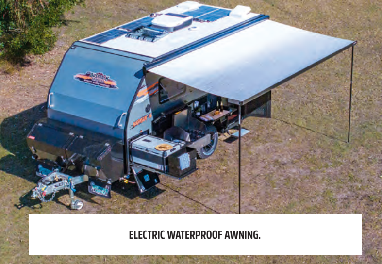
ELECTRIC WATERPROOF AWNING.