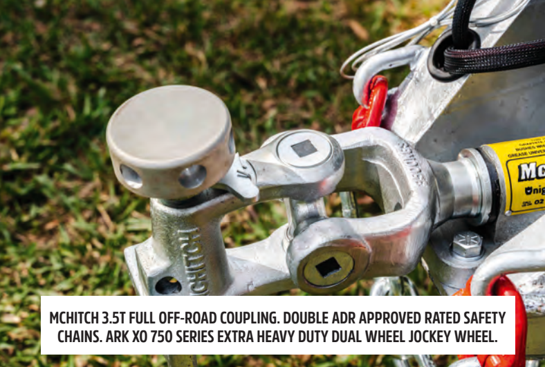
MCHITCH 3.5T FULL OFF-ROAD COUPLING. DOUBLE ADR APPROVED RATED SAFETY CHAINS. ARK X0 750 SERIES EXTRA HEAVY DUTY DUAL WHEEL JOCKEY WHEEL.