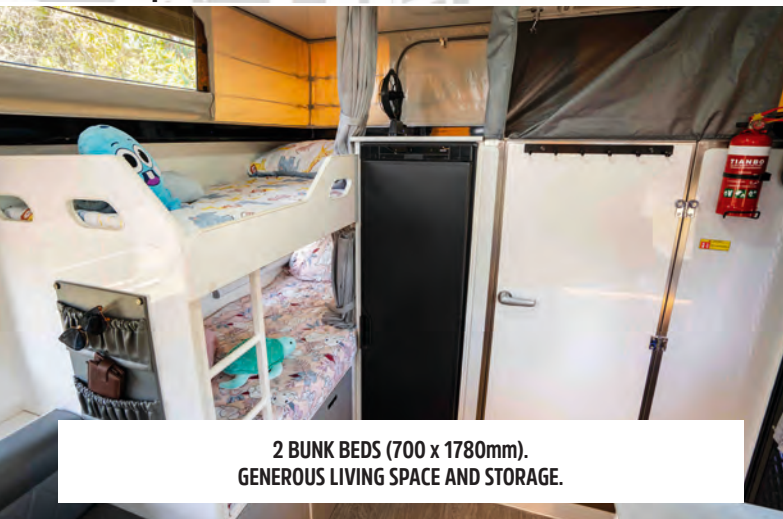
2 BUNK BEDS (700 x 1780mm). GENEROUS LIVING SPACE AND STORAGE.