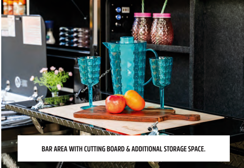
BAR AREA WITH CUTTING BOARD & ADDITIONAL STORAGE SPACE.