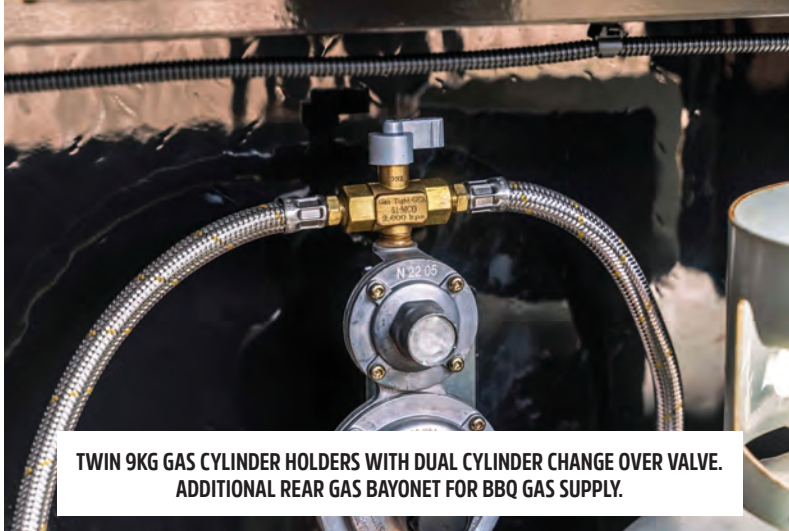
TWIN 9KG GAS CYLINDER HOLDERS WITH DUAL CYLINDER CHANGE OVER VALVE. ADDITIONAL REAR GAS BAYONET FOR BBQ GAS SUPPLY.