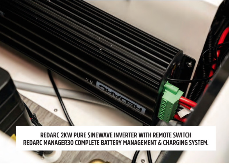
REDARC 2KW PURE SINEWAVE INVERTER WITH REMOTE SWITCH REDARC MANAGER30 COMPLETE BATTERY MANAGEMENT & CHARGING SYSTEM.