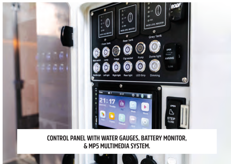
CONTROL PANEL WITH WATER GAUGES, BATTERY MONITOR, & MP5 MULTIMEDIA SYSTEM.