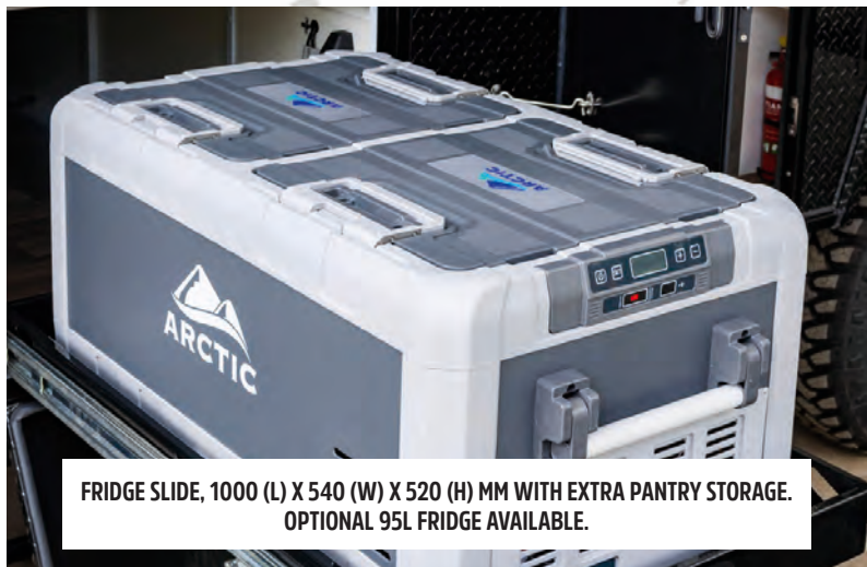
FRIDGE SLIDE, 1000 (L) X 540 (W) X 520 (H) MM WITH EXTRA PANTRY STORAGE. OPTIONAL 95L FRIDGE AVAILABLE.