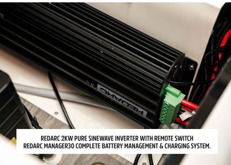
REDARC 2KW PURE SINEWAVE INVERTER WITH REMOTE SWITCH REDARC MANAGER30 COMPLETE BATTERY MANAGEMENT & CHARGING SYSTEM.