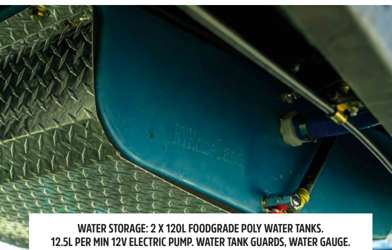
WATER STORAGE: 2 X 120L FOODGRADE POLY WATER TANKS. 12.5L PER MIN 12V ELECTRIC PUMP. WATER TANK GUARDS, WATER GAUGE.