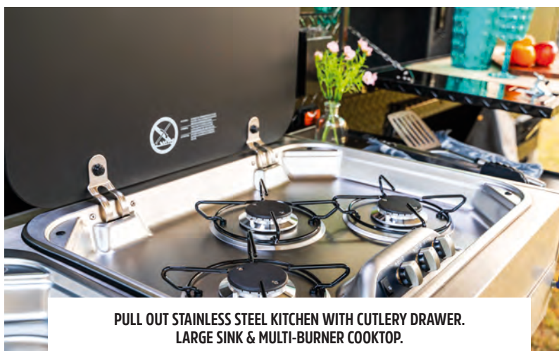
PULL OUT STAINLESS STEEL KITCHEN WITH CUTLERY DRAWER. LARGE SINK & MULTI-BURNER COOKTOP.