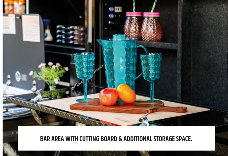
BAR AREA WITH CUTTING BOARD & ADDITIONAL STORAGE SPACE.