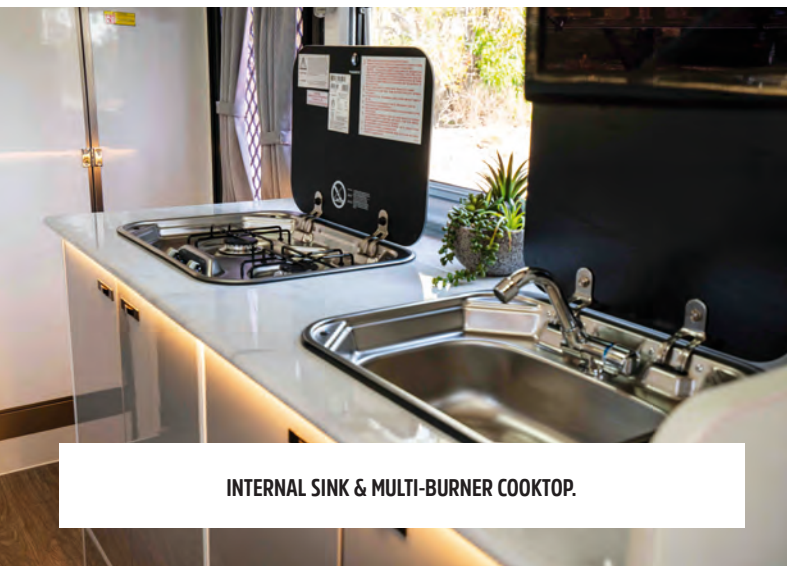
INTERNAL SINK & MULTI-BURNER COOKTOP.