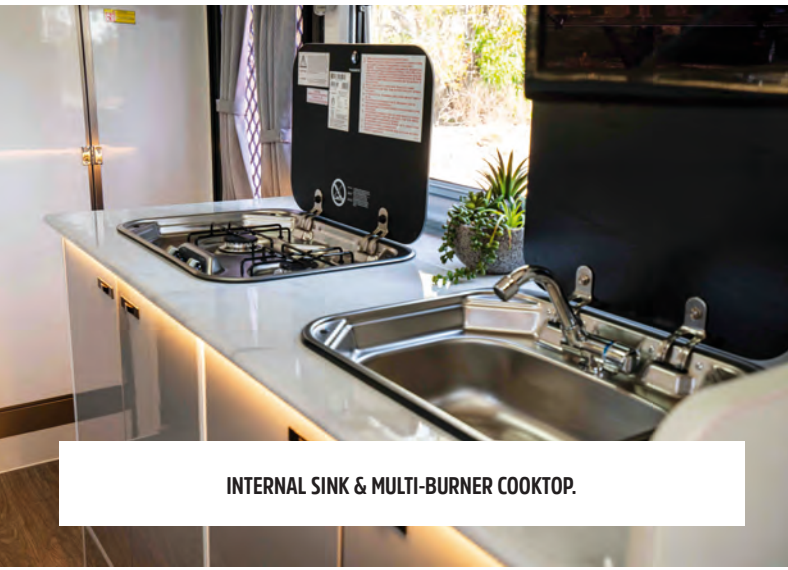
INTERNAL SINK & MULTI-BURNER COOKTOP.