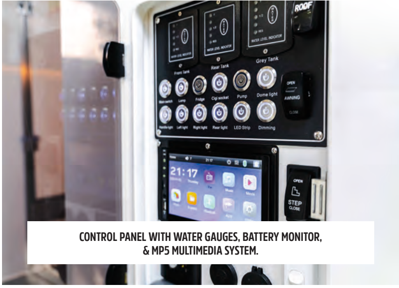
CONTROL PANEL WITH WATER GAUGES, BATTERY MONITOR, & MP5 MULTIMEDIA SYSTEM.